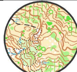
Semi-open areas, with landslides and vegetation details

All your Orienteering skills will turn to good account