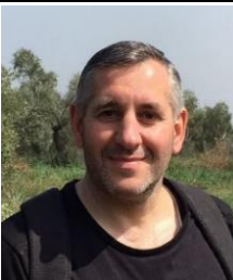
Sorin Popa, Mayor of Comarnic

With the assistance of The COMARNIC City Hall The SINAIA City Hall ROMSILVA, S.O. SINAIA