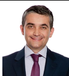
Vlad Oprea, Mayor of Sinaia