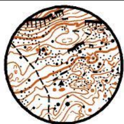
The rocky terrain, with specific microrelief

At Comarnic, the sides of Gurguiata Peak will offer you an incredible diversity of the types of the Orienteering terrain. You will meet up with all you can imagine: