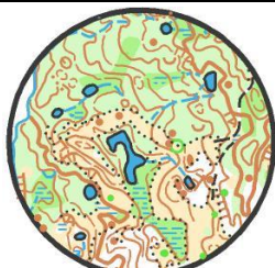
Lakes and swamps