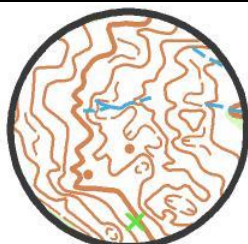
Clear forest, with microrelief details